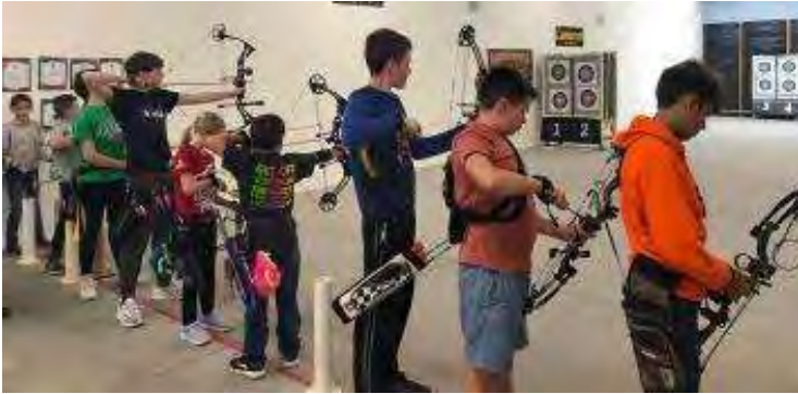
Juniors refining their skills